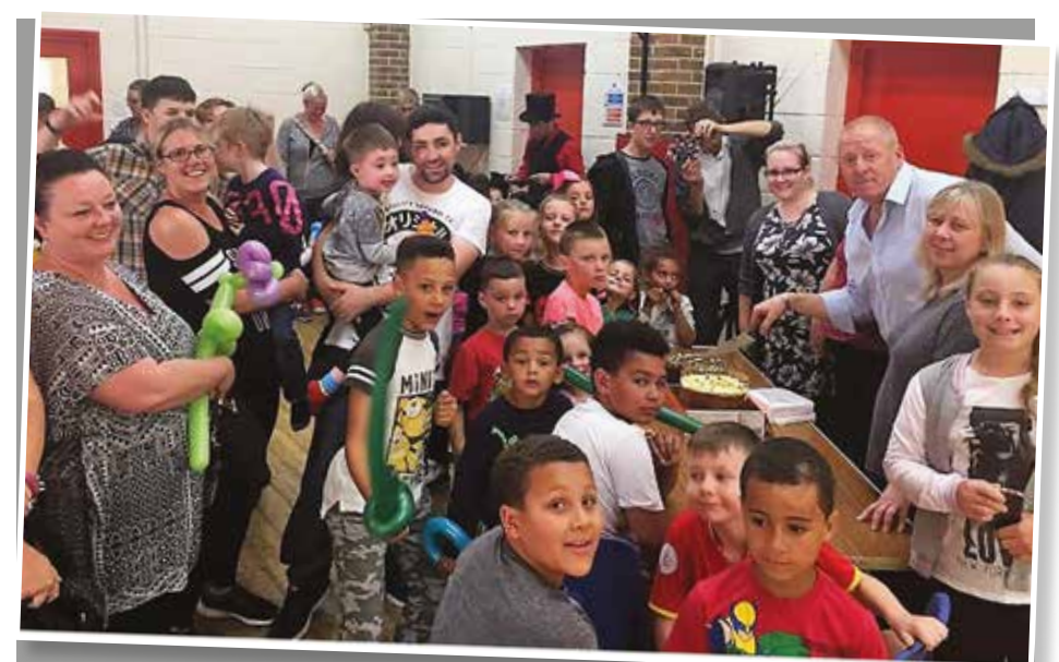
You can view the Neighbourhood Action Plan for Hangleton and Knoll at www.brighton-hove.gov.uk/hangleton-knoll-nap

This booklet has been developed by the Hangleton and Knoll Community Action Group supported by the Hangleton and Knoll Project and Brighton & Hove City Council in response to a community priority to develop communications across the neighbourhood. This priority forms part of the Neighbourhood Action Plan.